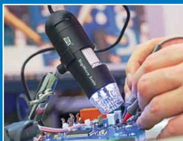
Onderhoud, reparatie en kalibratie