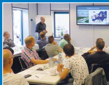
Cursussen en workshops